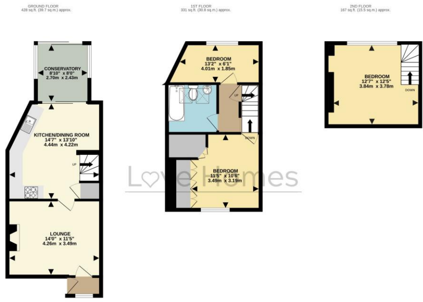
TOTAL FLOOR AREA: 926 sq.ft. (86.0 sq.m.) approx. Drawn by Love Homes for illustrative purposes only. Measurements and areas shown are approximate. Made with Metropix ©2024