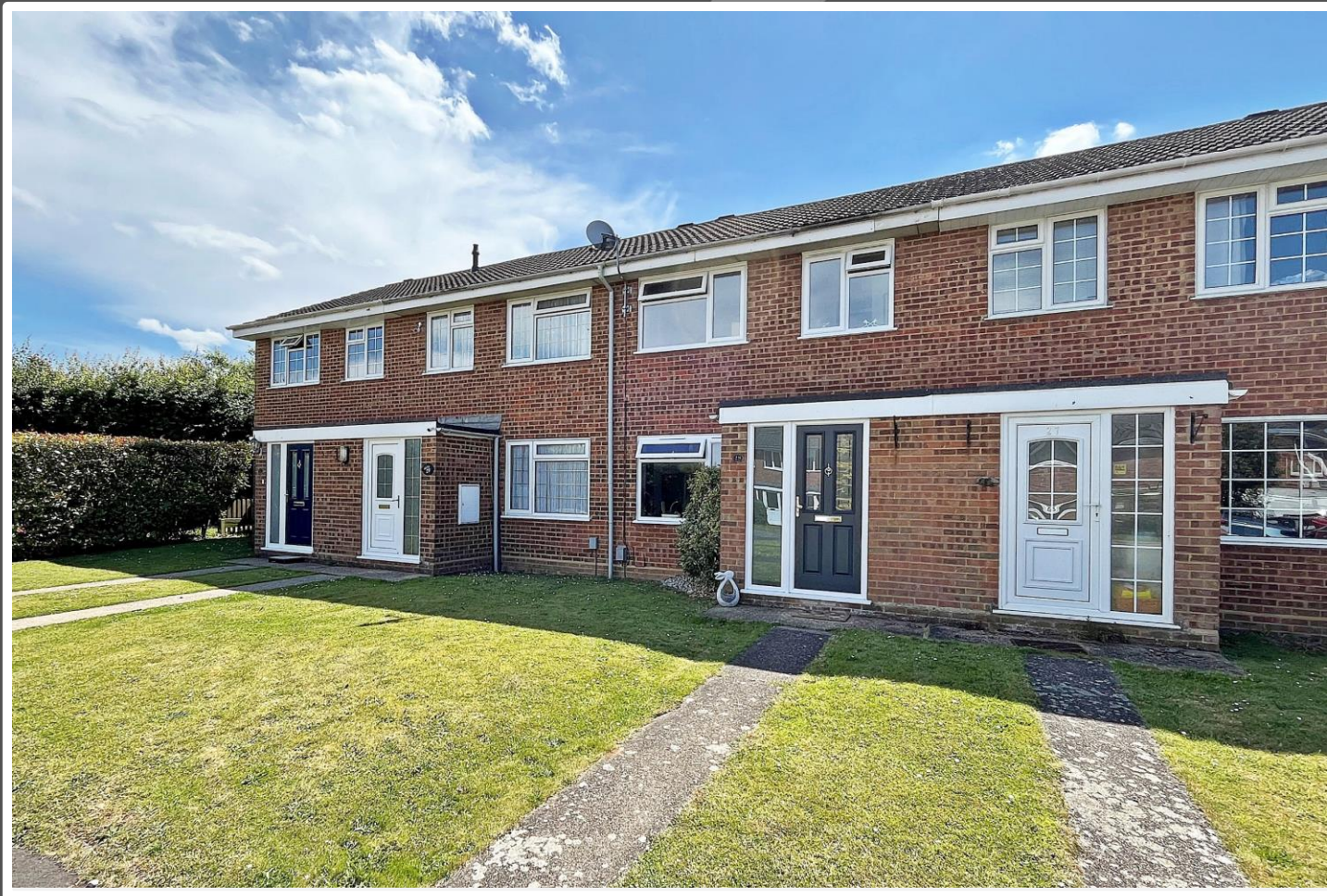
Primrose Close, Flitwick, Bedfordshire MK45 1PL