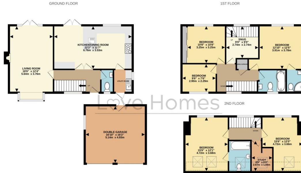
Drawn by Love Homes for illustrative purposes only. Measurements and areas shown are approximate. Made with Metropix ©2024