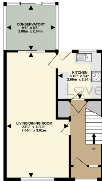
GROUND FLOOR 495 sq.ft. (46.0 sq.m.) approx.