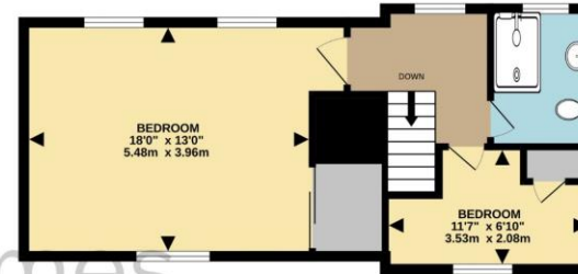
FIRST FLOOR 416 sq.ft. (38.6 sq.m.) approx.