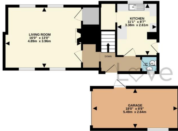
GROUND FLOOR 563 sq.ft. (52.3 sq.m.) approx.