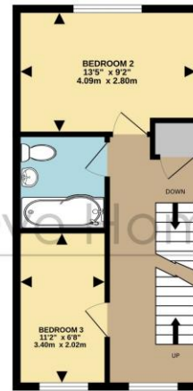
1ST FLOOR 371 sq.ft. (34.5 sq.m.) approx.