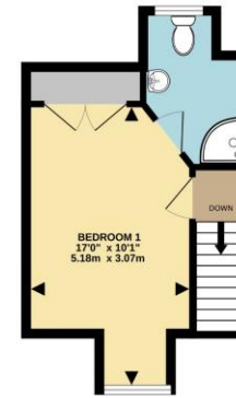
2ND FLOOR 245 sq.ft. (22.7 sq.m.) approx.