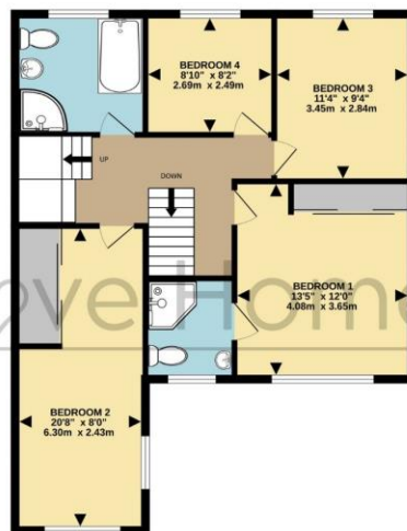
1ST FLOOR 754 sq.ft. (70.1 sq.m.) approx.