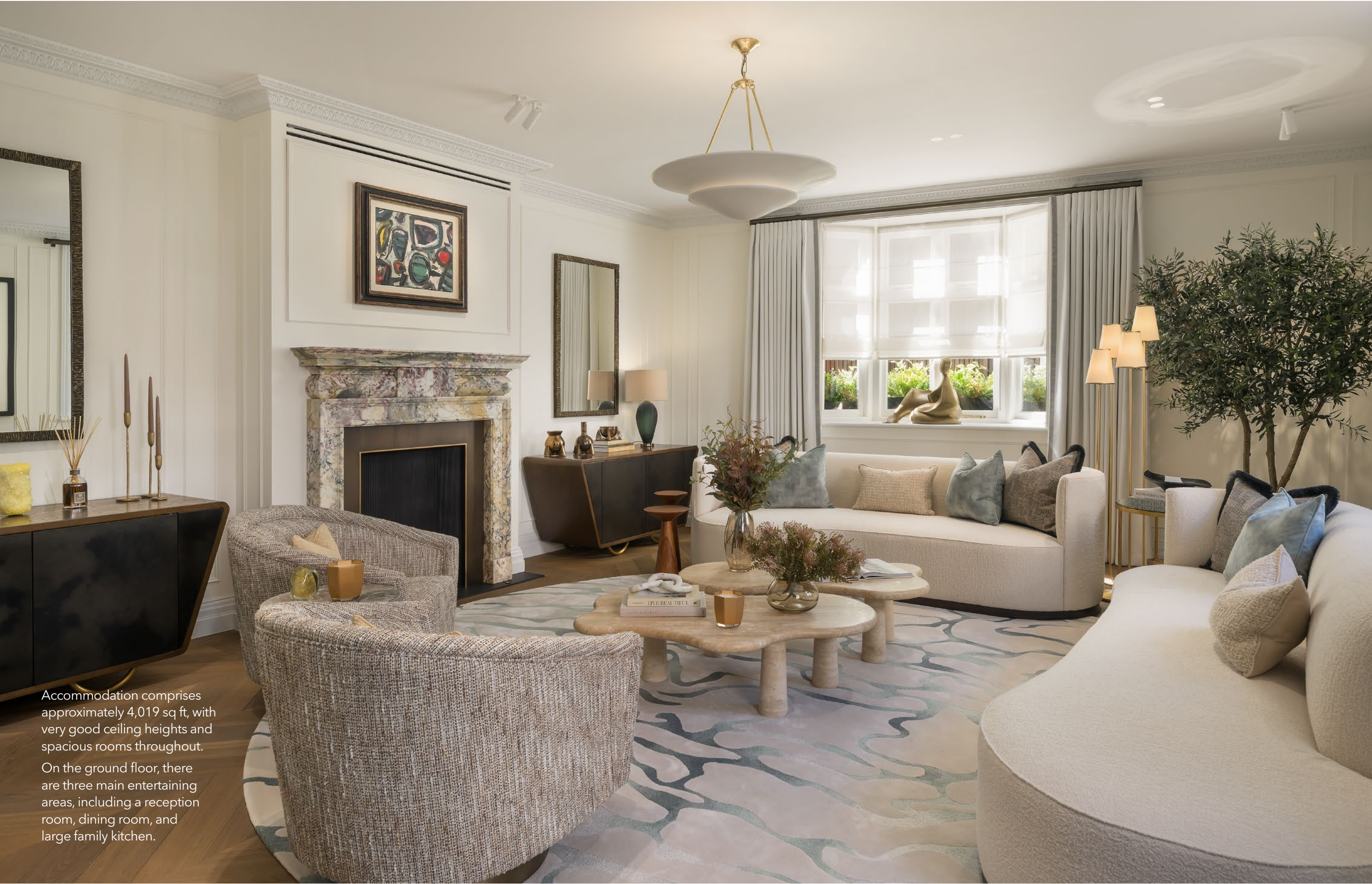
Accommodation comprises approximately 4,019 sq ft, with very good ceiling heights and spacious rooms throughout. On the ground floor, there are three main entertaining areas, including a reception room, dining room, and large family kitchen.