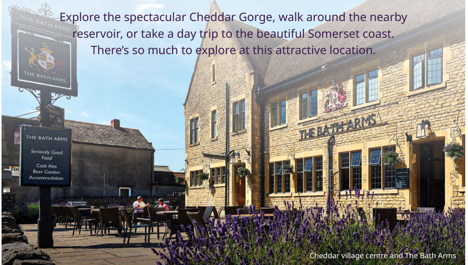
Cheddar village centre and The Bath Arms

Explore the spectacular Cheddar Gorge, walk around the nearby reservoir, or take a day trip to the beautiful Somerset coast. There's so much to explore at this attractive location.