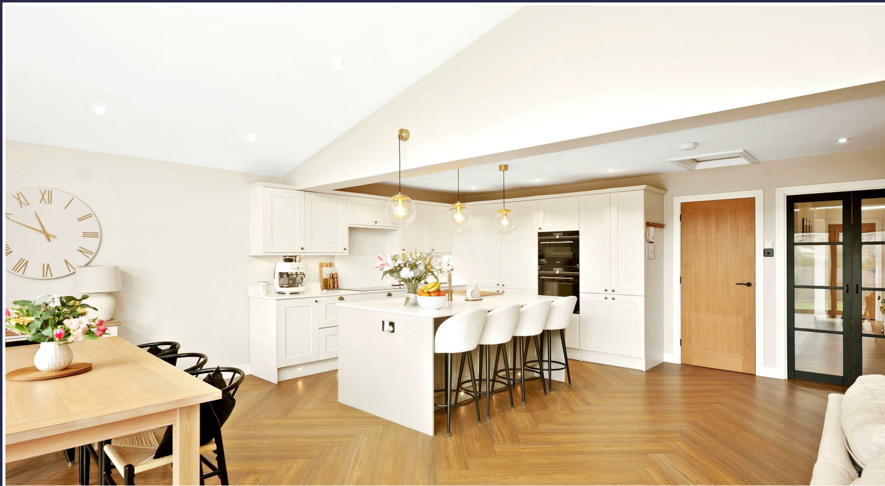
CHERRY TREE LODGE, ALDERHOLT, SP6 3AU