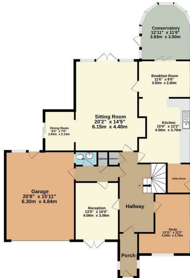
GROUND FLOOR 1691 sq.ft. (157.1 sq.m.) approx.