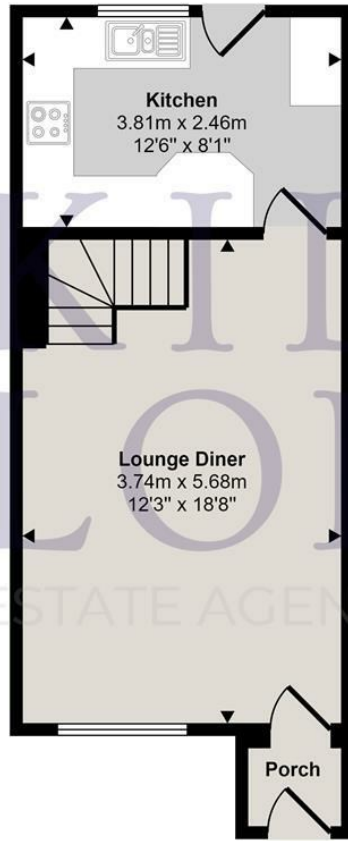
Ground Floor Approx 33 sq m / 352 sq ft