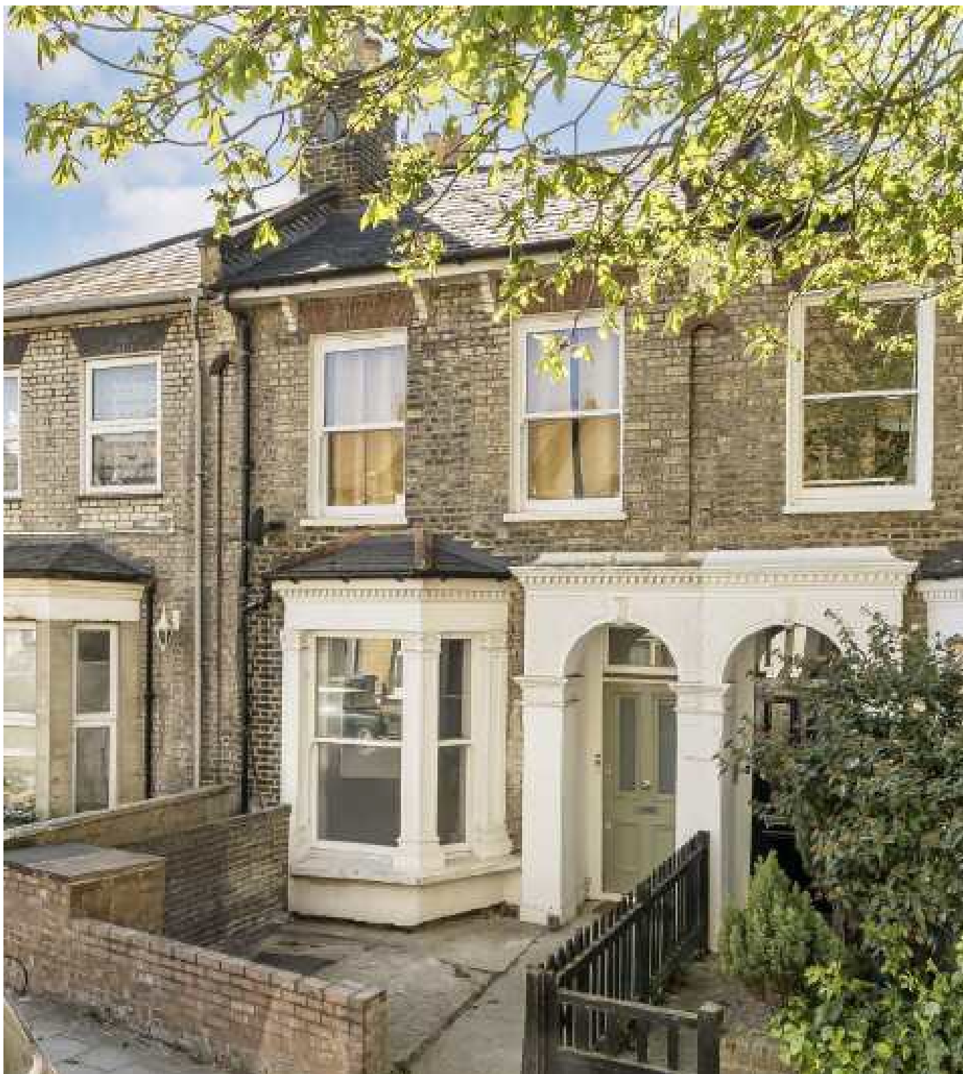
Melbourne Grove, SE22 £700,000