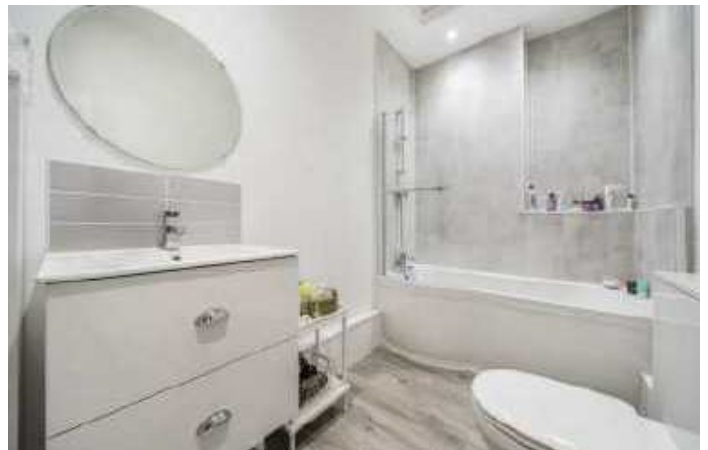
Peckham Rye, SE22