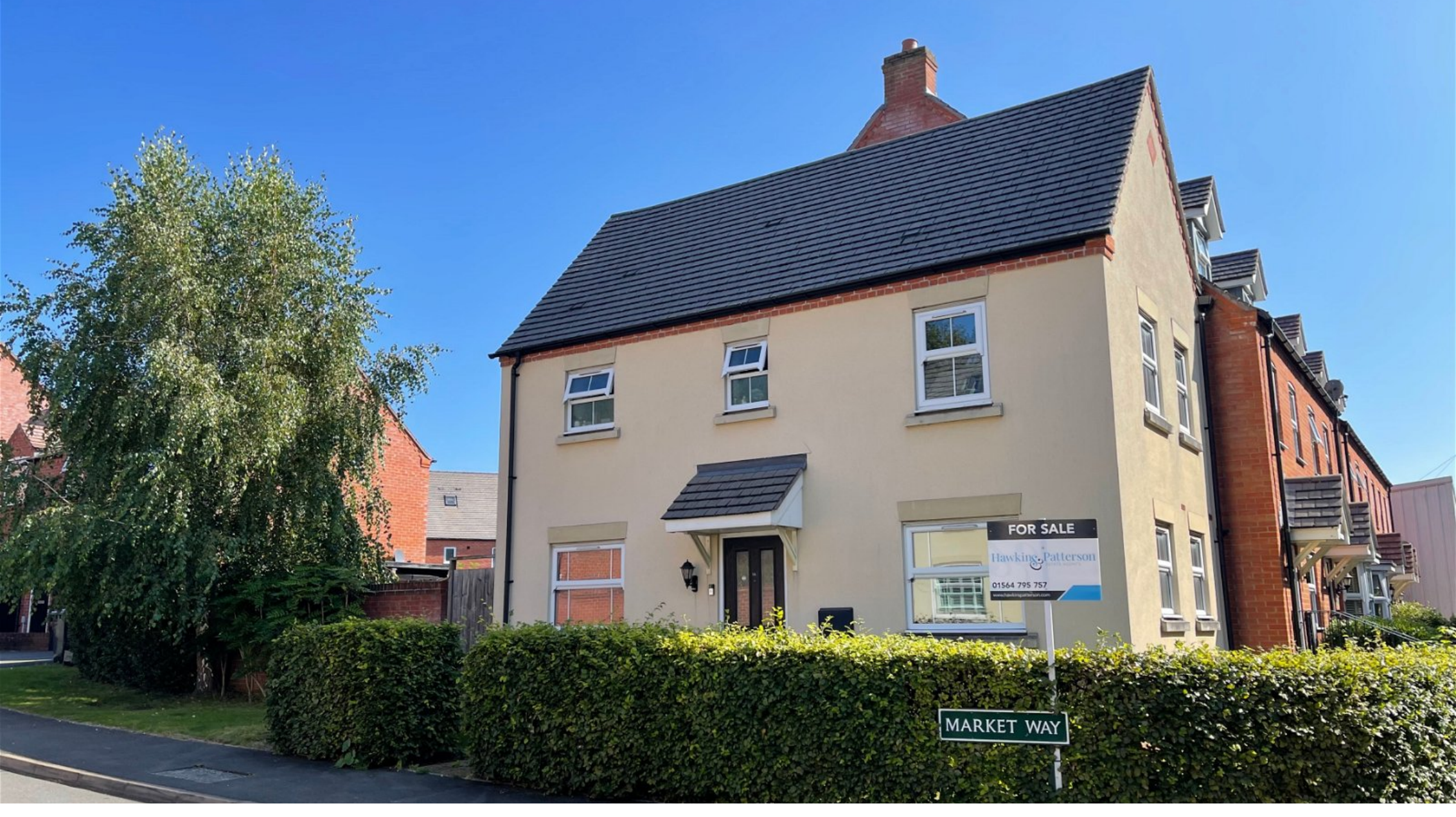
Market Way, Henley in Arden, B95 5FD