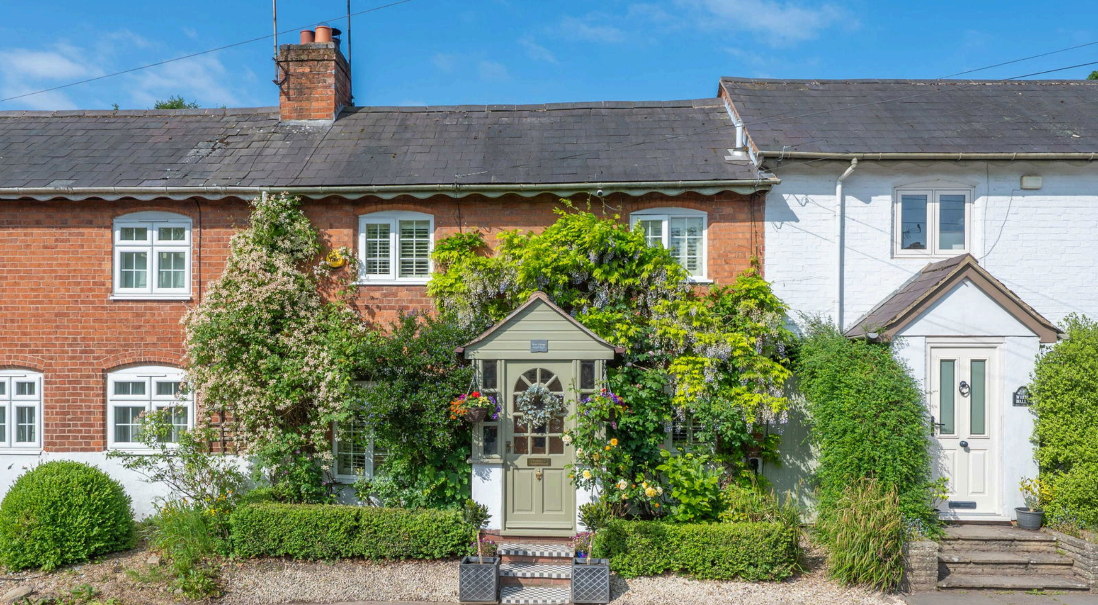
Rose Cottage, Lapworth Street, Lowsonford, Henley-in-Arden, B95 5HG