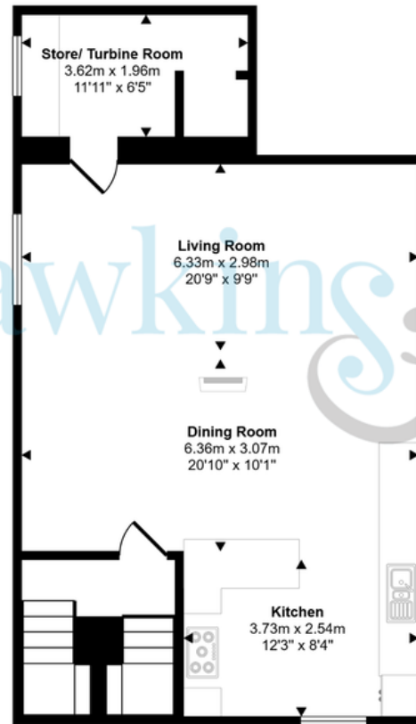
First Floor Approx 65 sq m / 699 sq ft