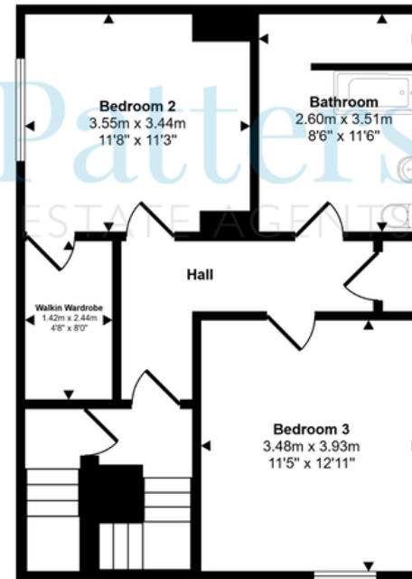
Second Floor Approx 55 sq m / 590 sq ft