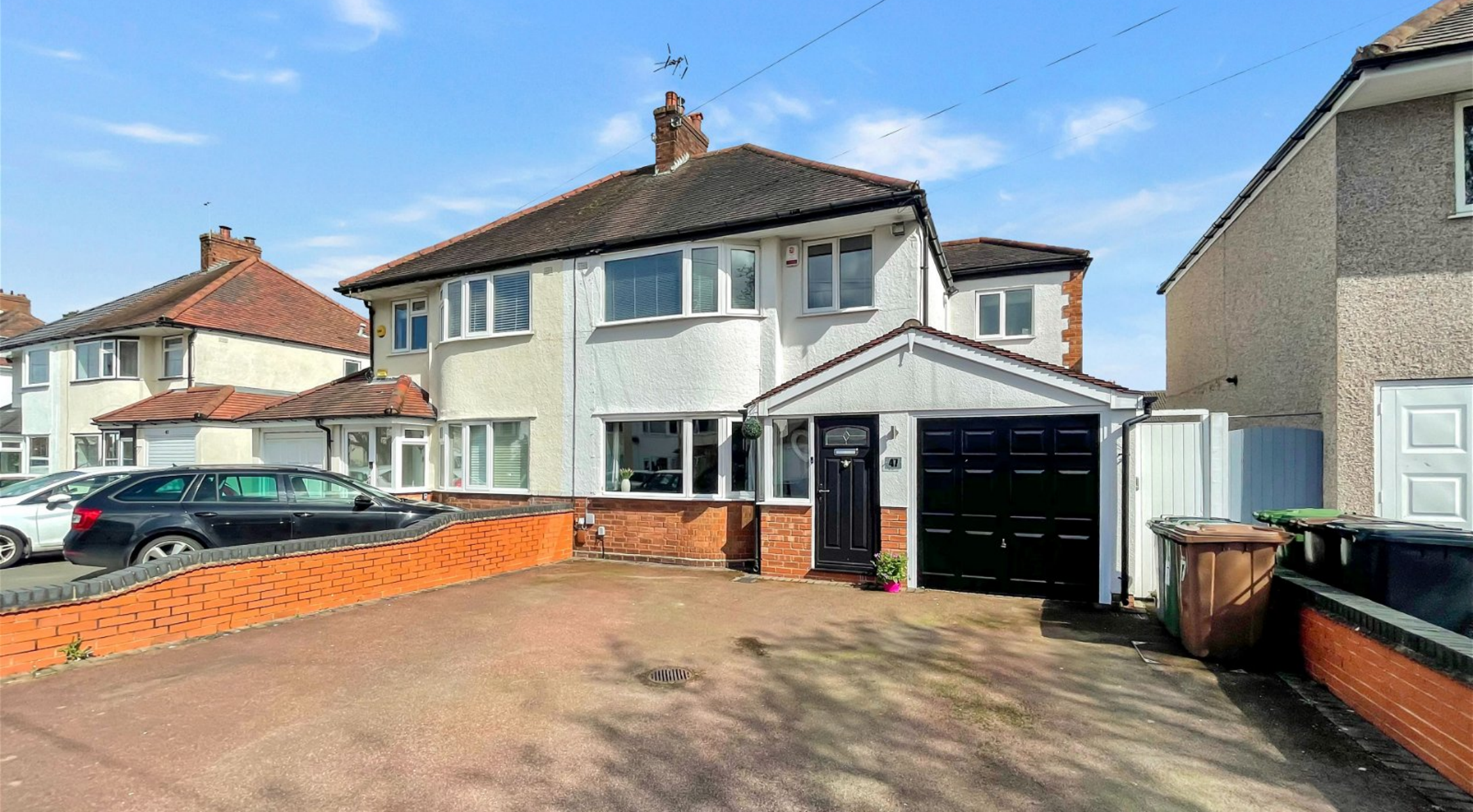
Fabian Crescent, Shirley, Solihull.