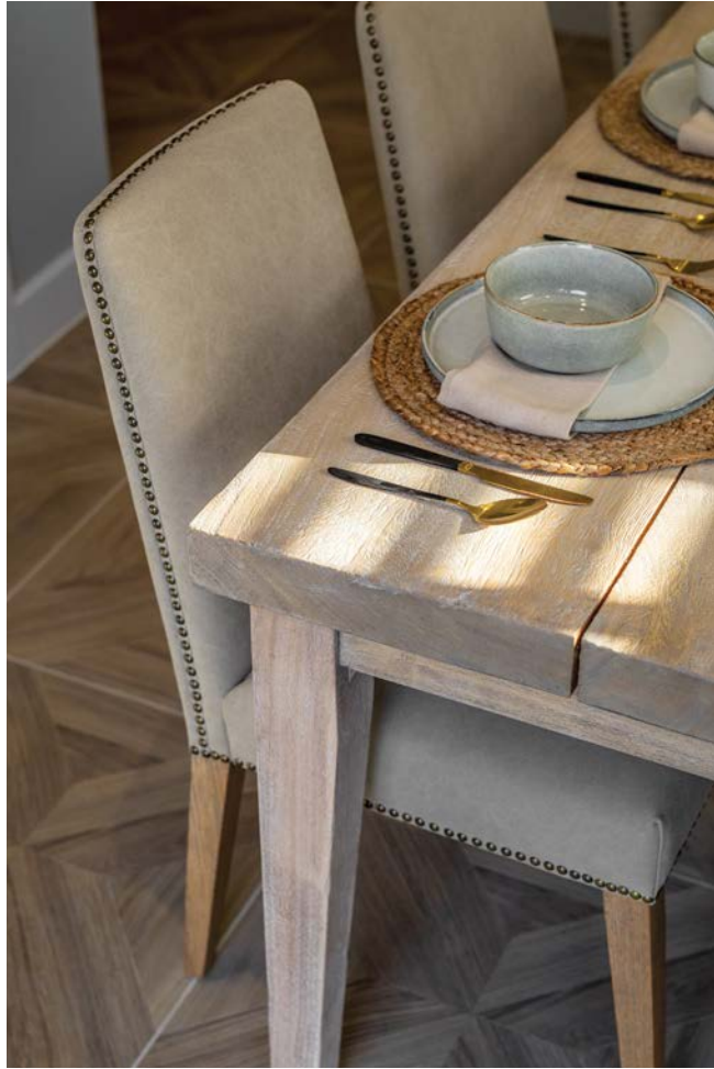
ABOVE & RIGHT Typical Devonshire Homes interiors — not site specific