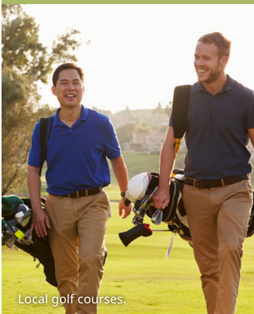
Local golf courses.