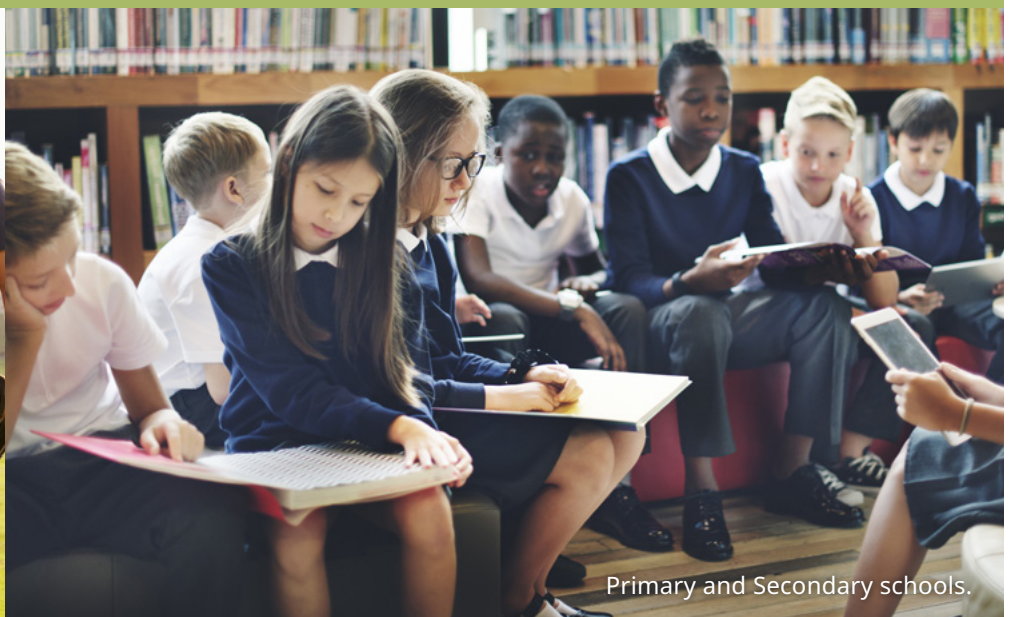
Primary and Secondary schools.