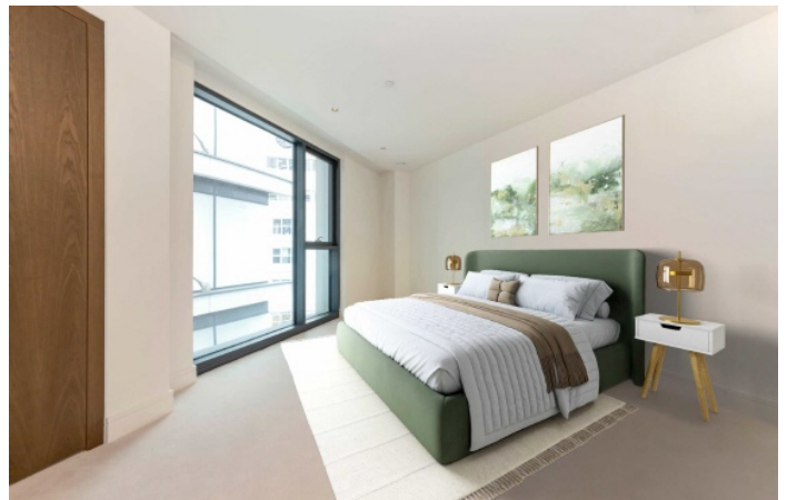
Harbour Avenue, SW10