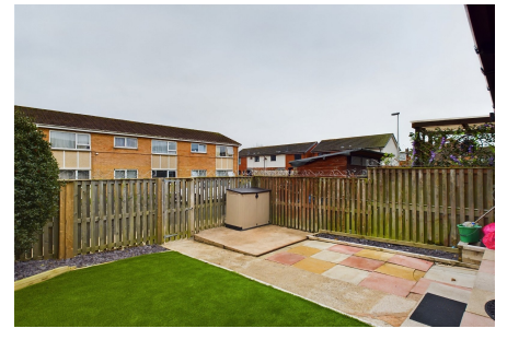
Chesham & West are pleased to present this two bedroom mid terrace home in Bispham.

The property is well situated in this quiet location only a short distance from local shops and amenities, as well as schools, colleges and transport links. An ideal first time buy or buy-to-let opportunity!