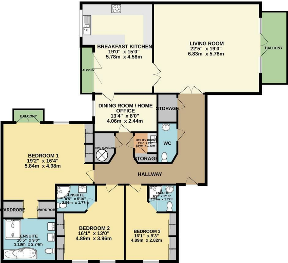
TOTAL FLOOR AREA: 1967 sq.ft. (182.7 sq.m.) approx. Not to scale for identification purposes only Made with Metropix ©2025 SECOND FLOOR 1967 sq.ft. (182.7 sq.m.) approx.