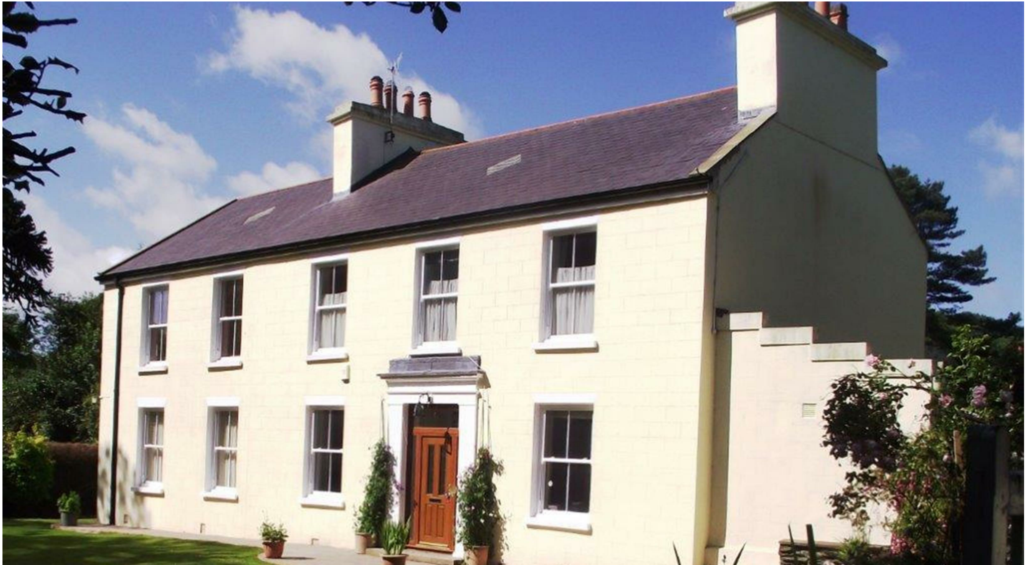
Ashbourne House Ballacrine, St Johns, Isle of Man, IM4 3NF Asking Price £1,100,000