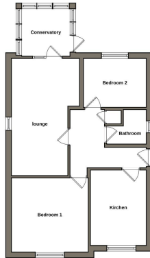
Floorplan is indicative of layout only and should not be used for accurate measurement or structural purposes.