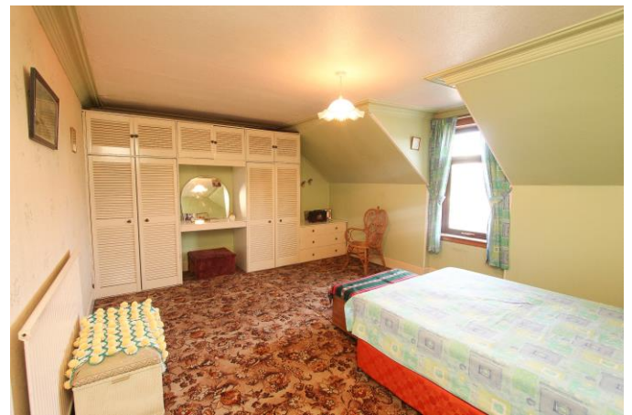
BEDROOM 2: A bedroom to the front with CH radiator.