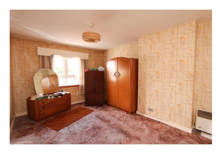
BEDROOM 2: A further bedroom to the front.

A bedroom to the front with large built-in cupboard housing the hot water tank.