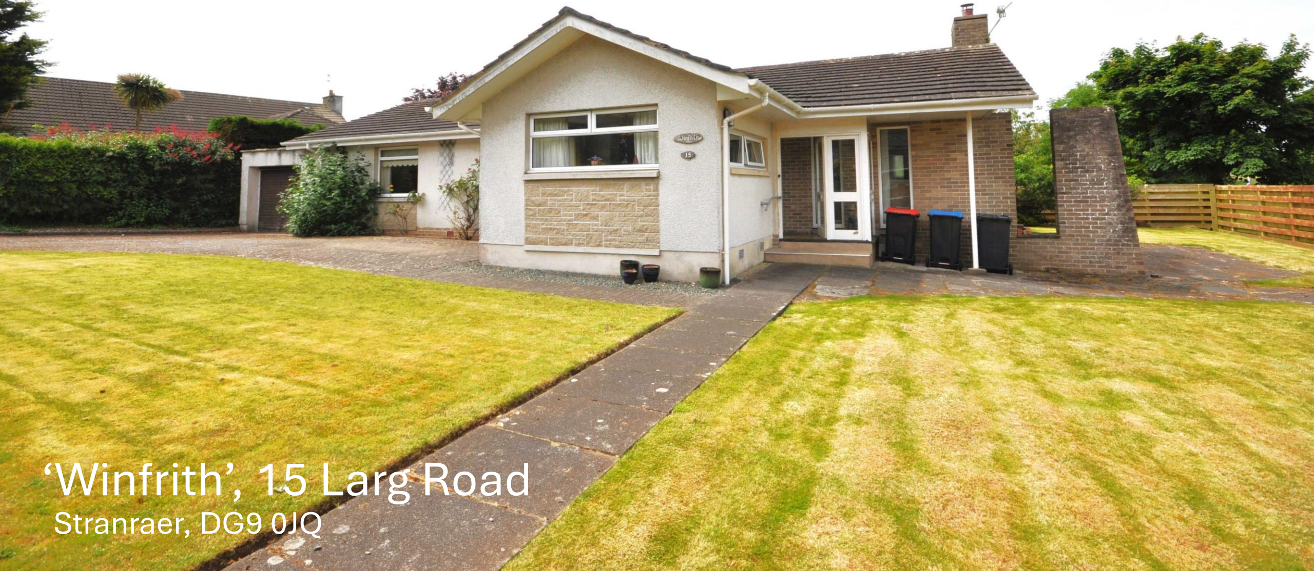
‘Winfrith’, 15 Larg Road Stranraer, DG9 0JQ