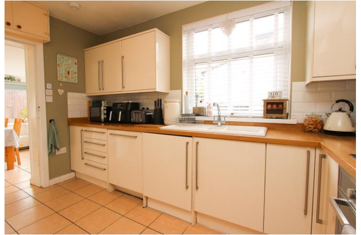
Further kitchen image