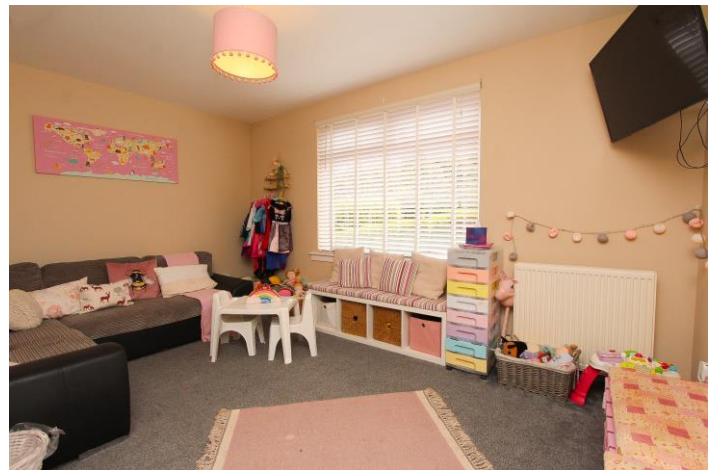
BEDROOM 2: (Approx 3.17m – 4.25m) A bedroom to the rear overlooking the rear garden. CH radiator.