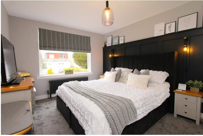
BEDROOM 1: (Approx 4.42m – 3.14m) A bedroom to the front with built-in wardrobe, Victorian style CH radiator and TV point.