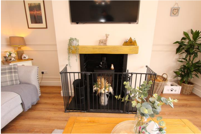
Further lounge image