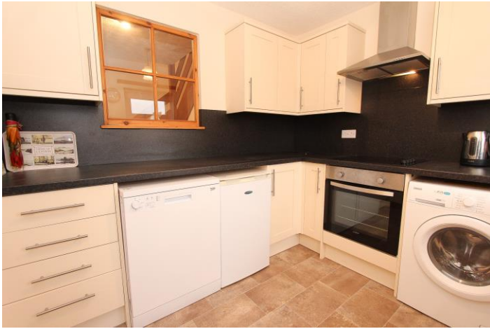
Further kitchen image