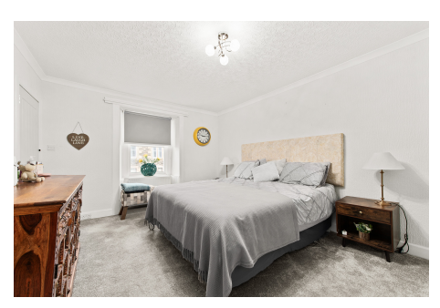
3 Beds | 2 Baths | 127m2