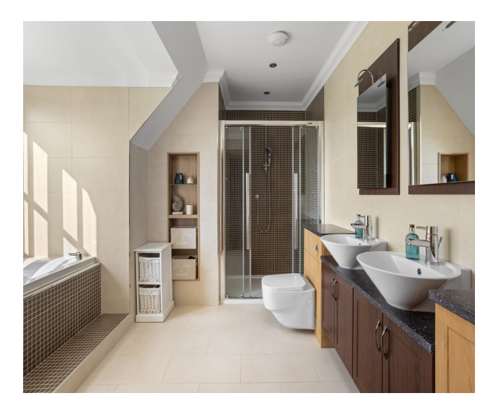
5 Bed | 5 Bath | 540m2