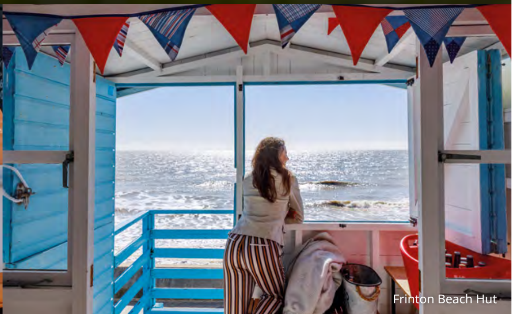
Frinton Beach Hut