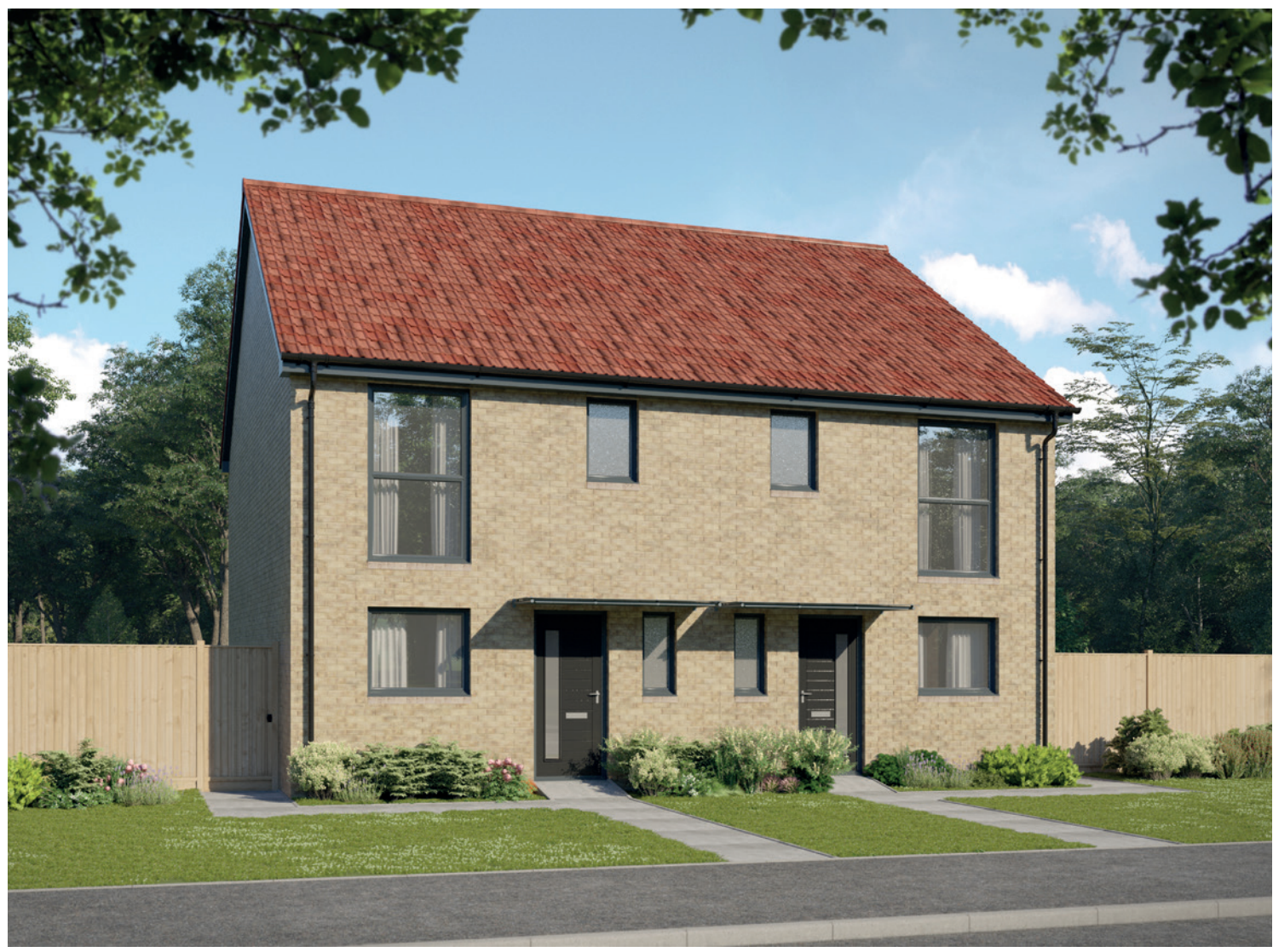
CGI illustrative of plots 19-20. Please see Sales Advisor for details of your chosen plot.