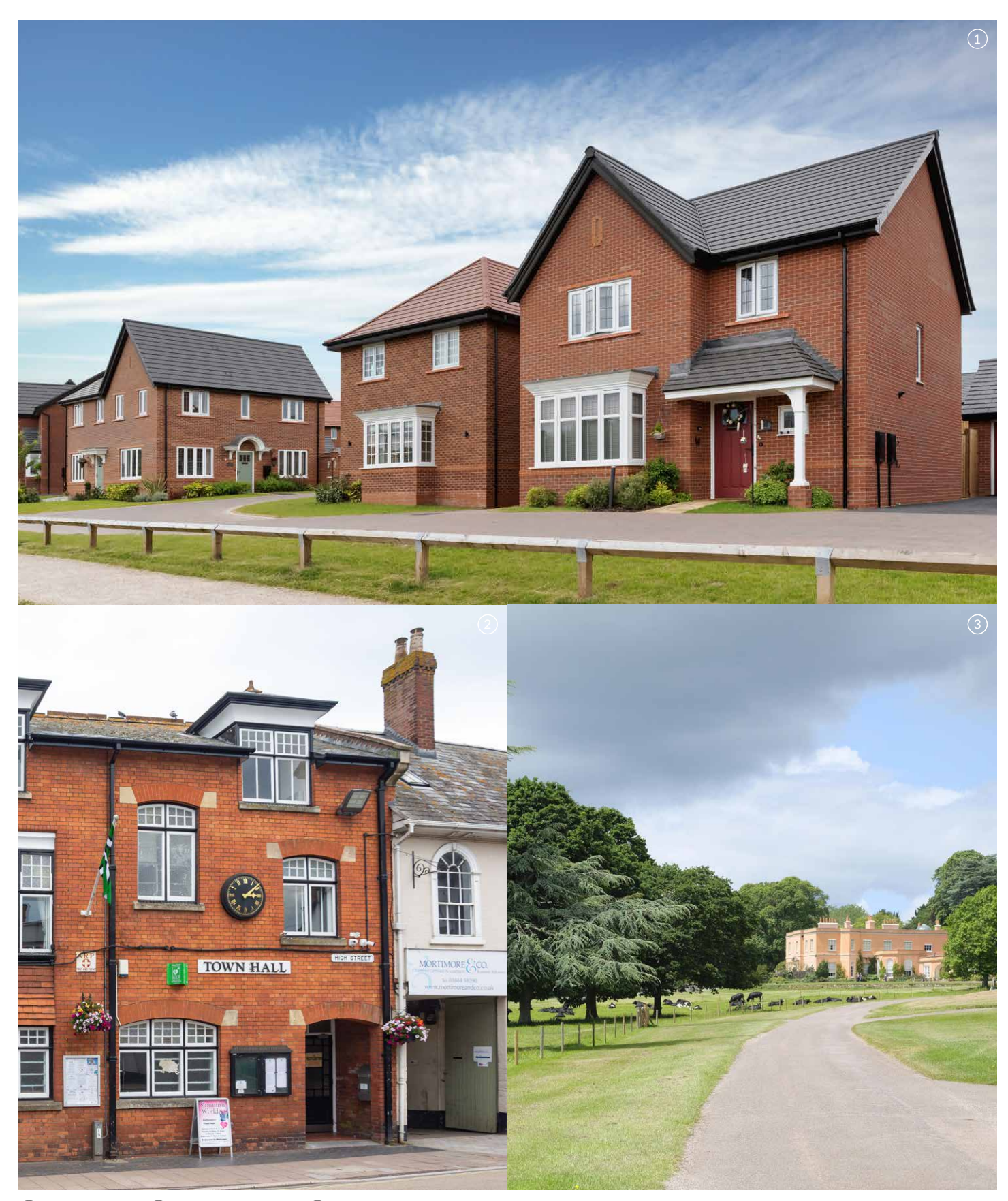
\textcircled{1} \hookrightarrow \mathsf{Wistaston} \mathsf{Brook} \ \textcircled{2} \hookrightarrow \mathsf{Cullompton} \mathsf{Town} \mathsf{Hall} \ \textcircled{3} \hookrightarrow \mathsf{Killerton} \mathsf{National} \mathsf{Trust} \mathsf{House} \mathsf{and} \mathsf{Garden}