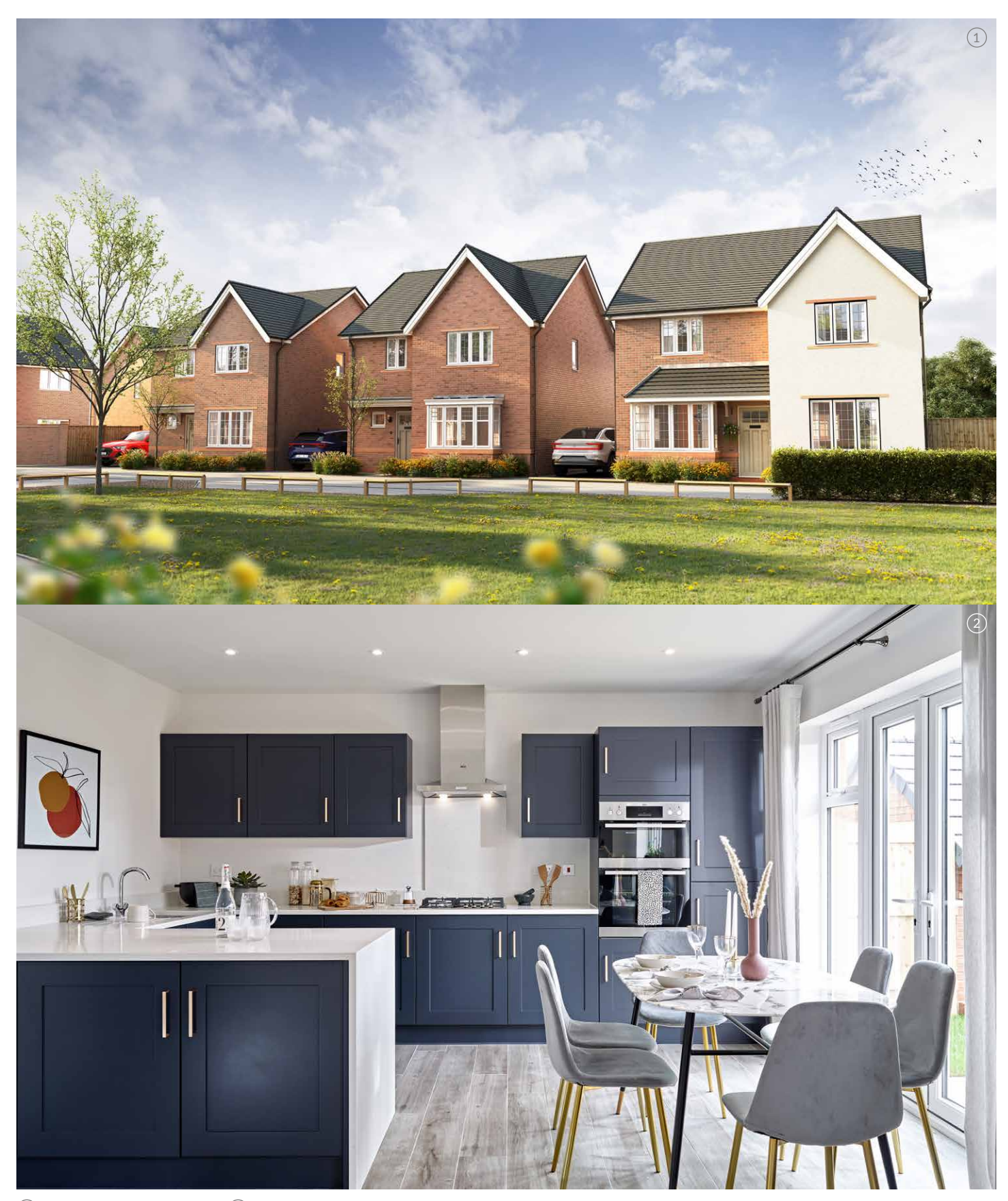
\textcircled{1} \hookrightarrow \mathsf{The} \mathsf{ Meadows} \mathsf{ Street} \mathsf{ Scene} \mathsf{ CGI} \quad \textcircled{2} \hookrightarrow \mathsf{Typical} \mathsf{ Interior}