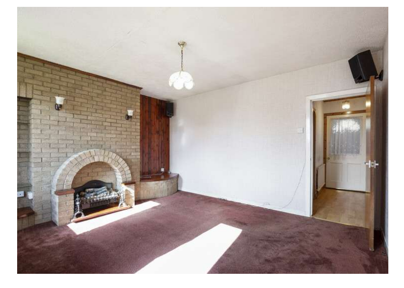
13 Montrose Crescent, Lochore, Lochgelly KY5 8EA