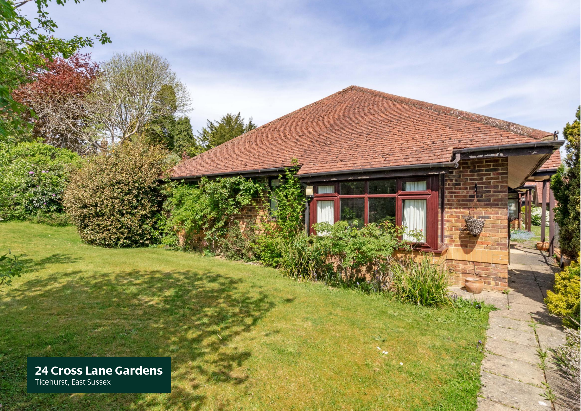
24 Cross Lane Gardens Ticehurst, East Sussex