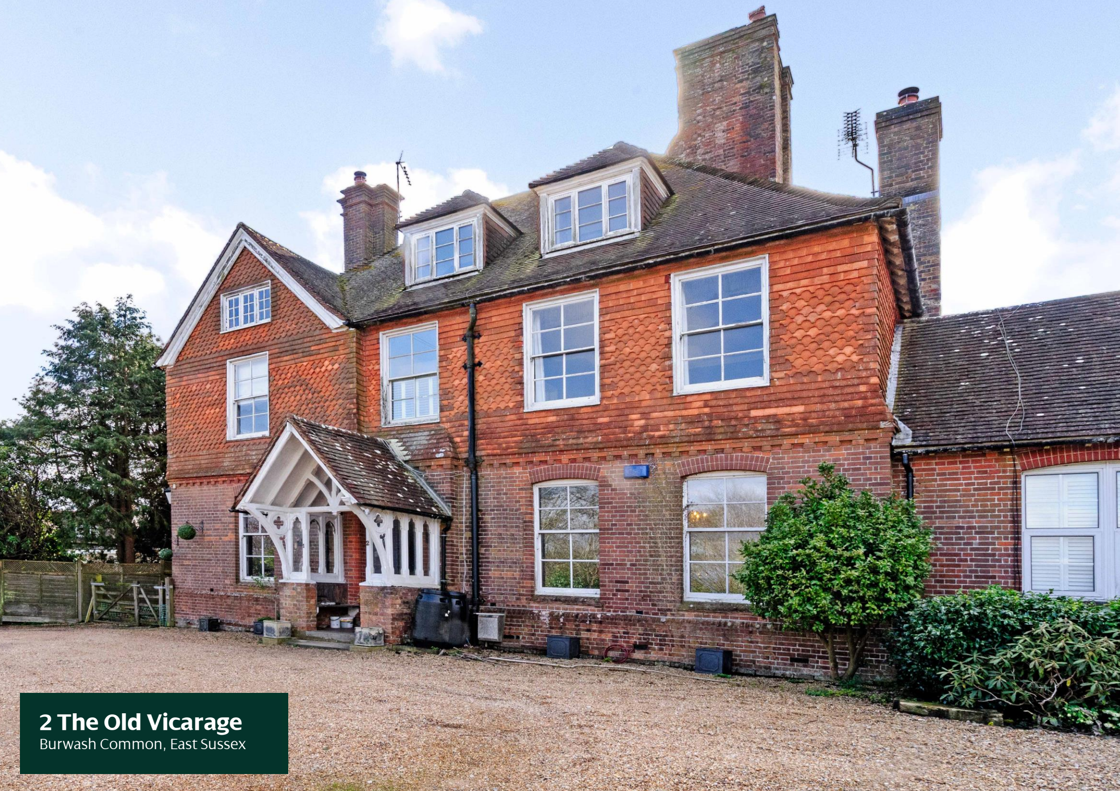
2 The Old Vicarage Burwash Common, East Sussex