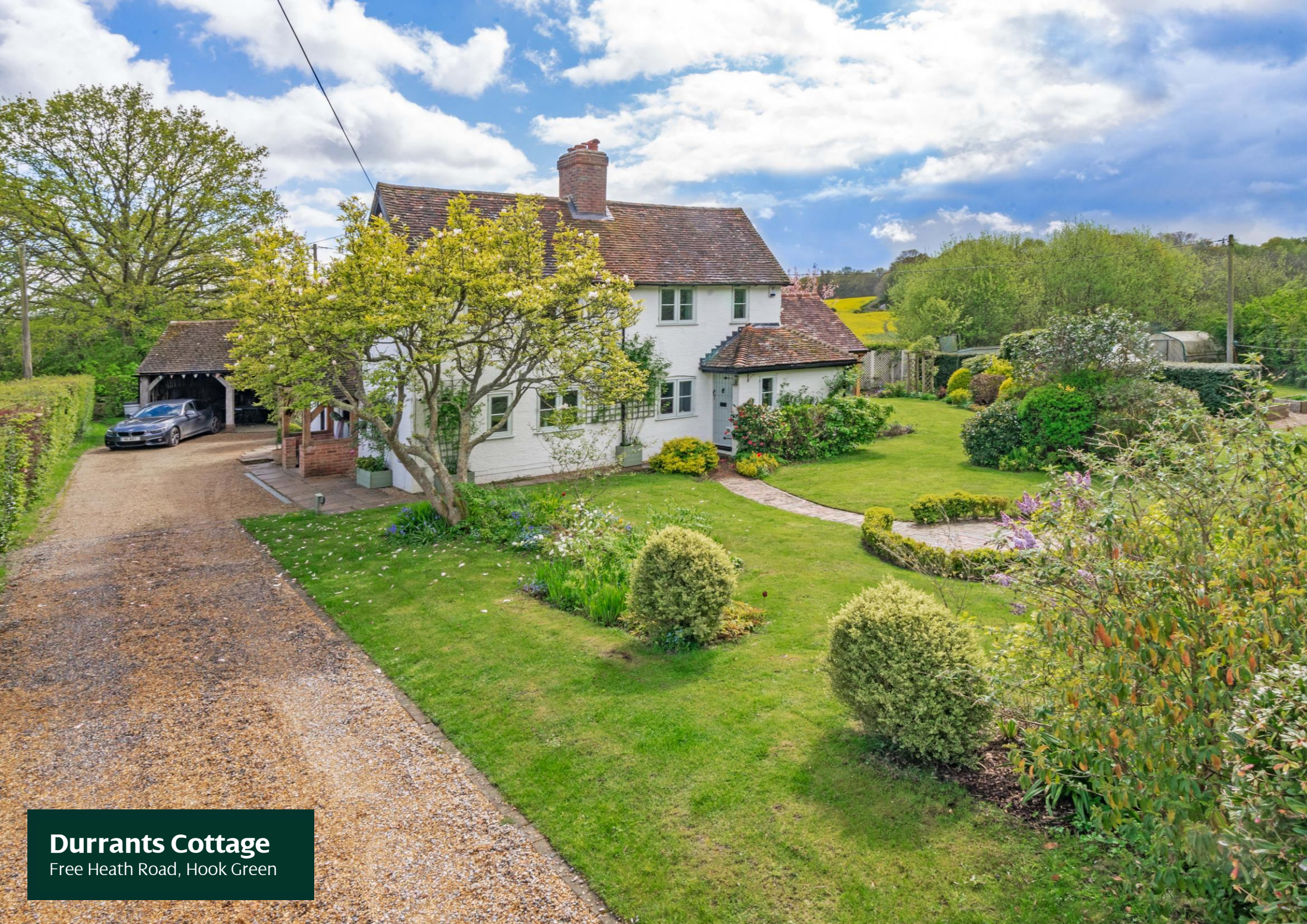
Durrants Cottage Free Heath Road, Hook Green