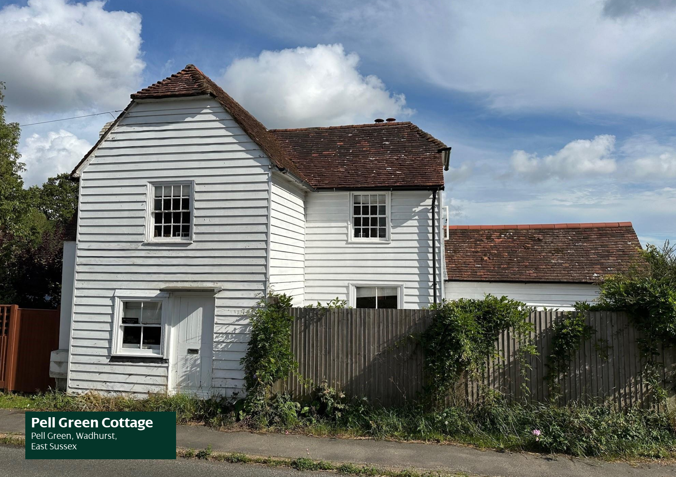
Pell Green Cottage Pell Green, Wadhurst, East Sussex