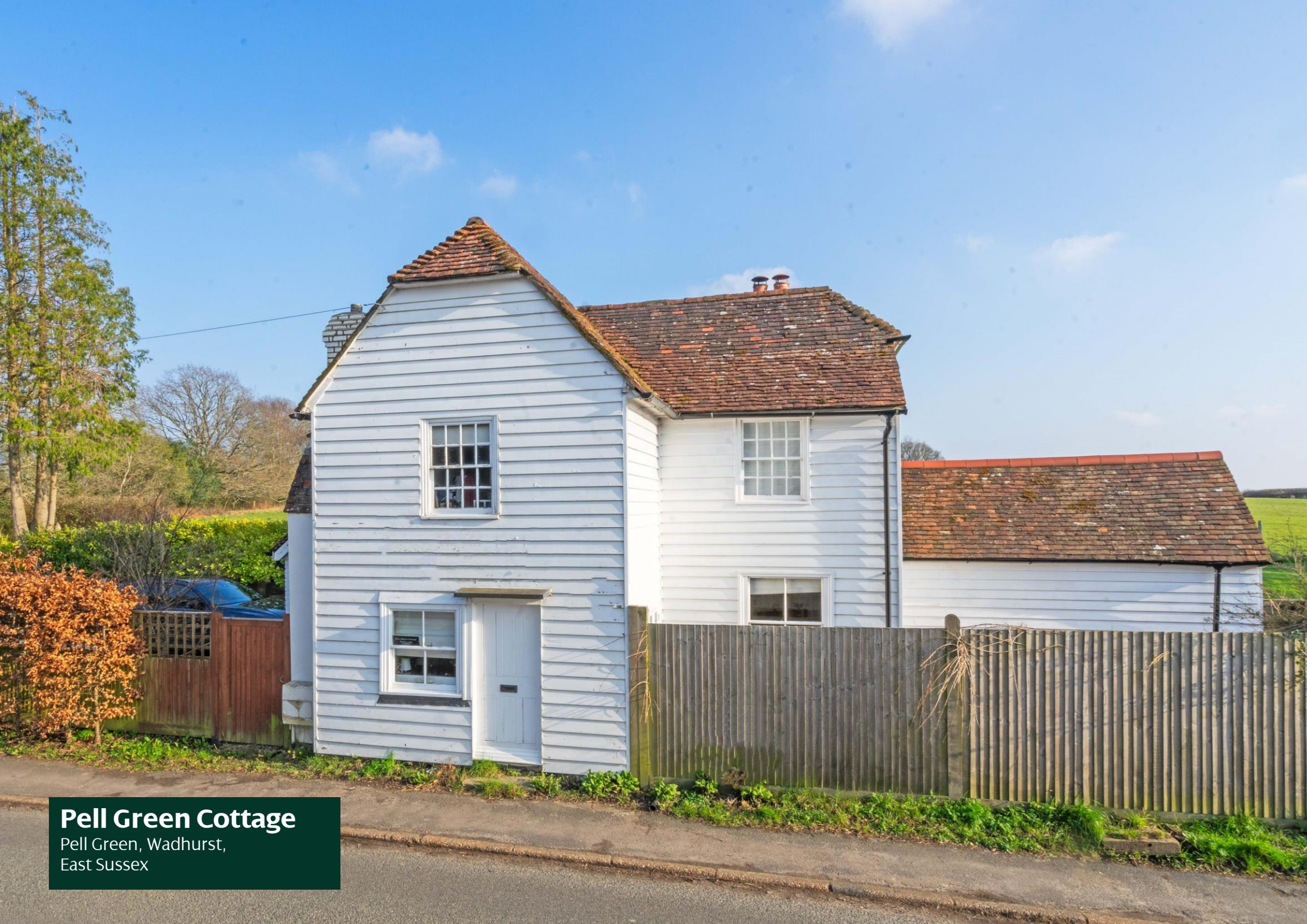
Pell Green Cottage Pell Green, Wadhurst, East Sussex