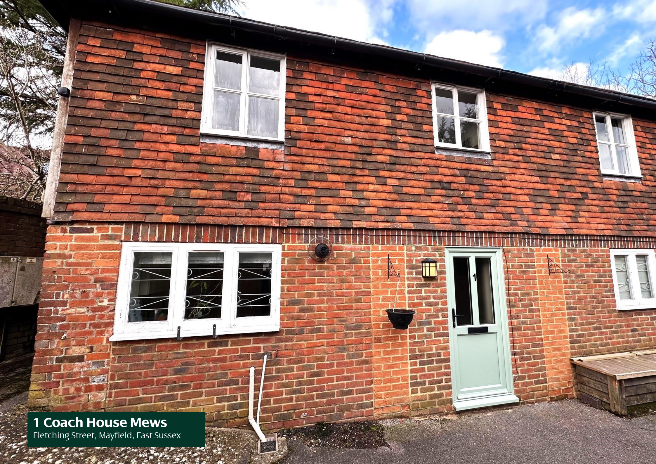
1 Coach House Mews Fletching Street, Mayfield, East Sussex