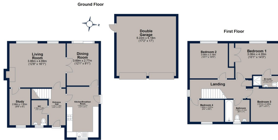
Total area: approx. 138.9 sq. metres (1494.9 sq. feet) Plan is for illustration purposes only and may not be representative of the property. Plan is not to scale. Plan produced by M-Photo Plan produced using PlanUp.