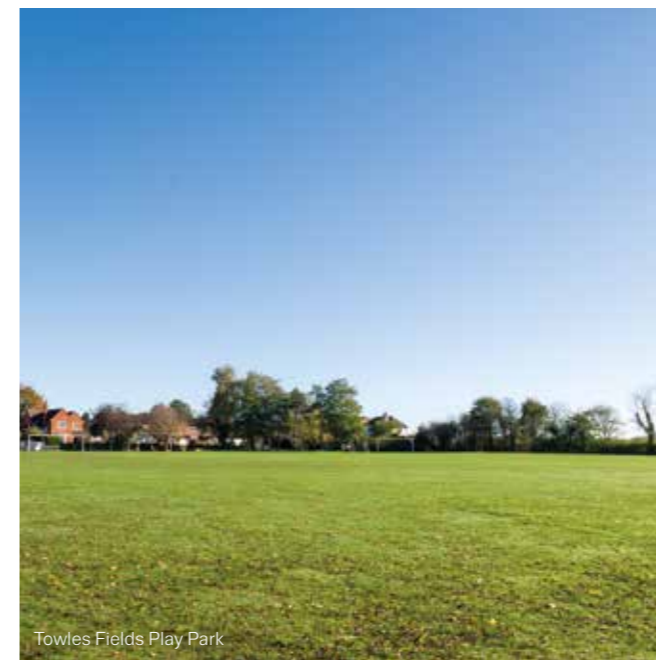
Towles Fields Play Park

Burton on the Wolds has something for everyone, with plenty to see and do right on your doorstep. From schools, nurseries and churches to cafes, restaurants, salons and barbers, most of life's essentials are all within a 10-minute drive of your new home. So, whether you're a couple, growing family or looking to downsize to a more peaceful location, there is something for everyone at Honeysuckle Rise.