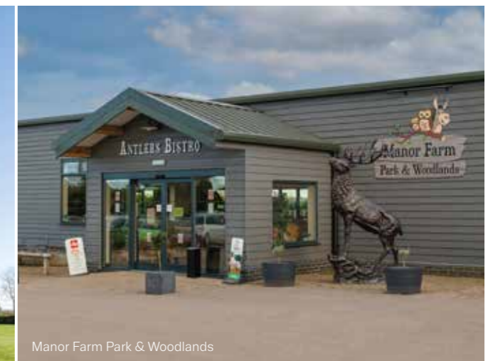
Manor Farm Park & Woodlands