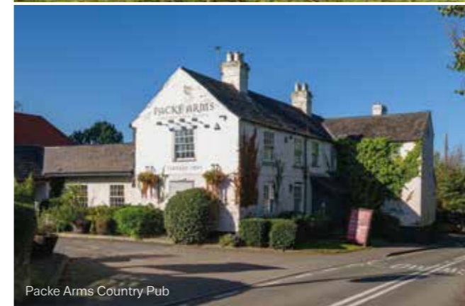
Packe Arms Country Pub