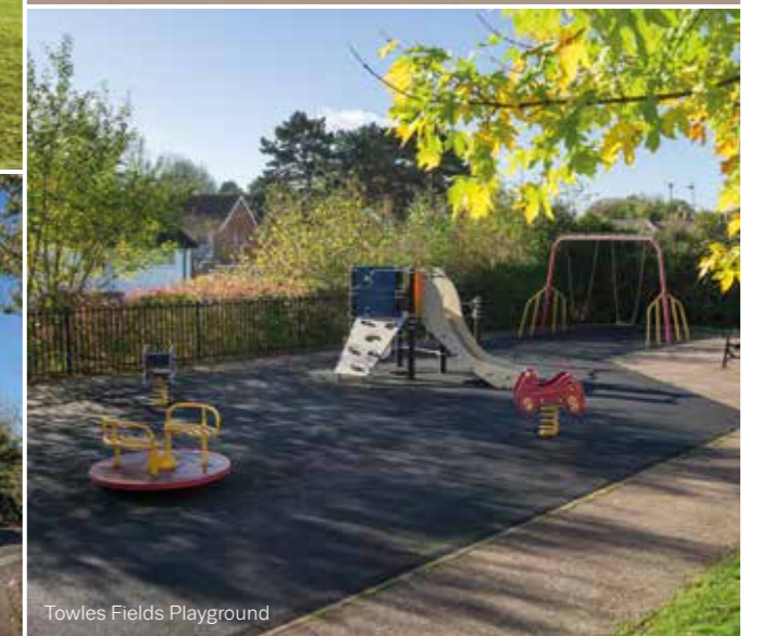
Towles Fields Playground

Our stunning new development consists of 70 plots that offer an excellent choice of 2-5-bedroom homes, all beautifully designed inside and out.