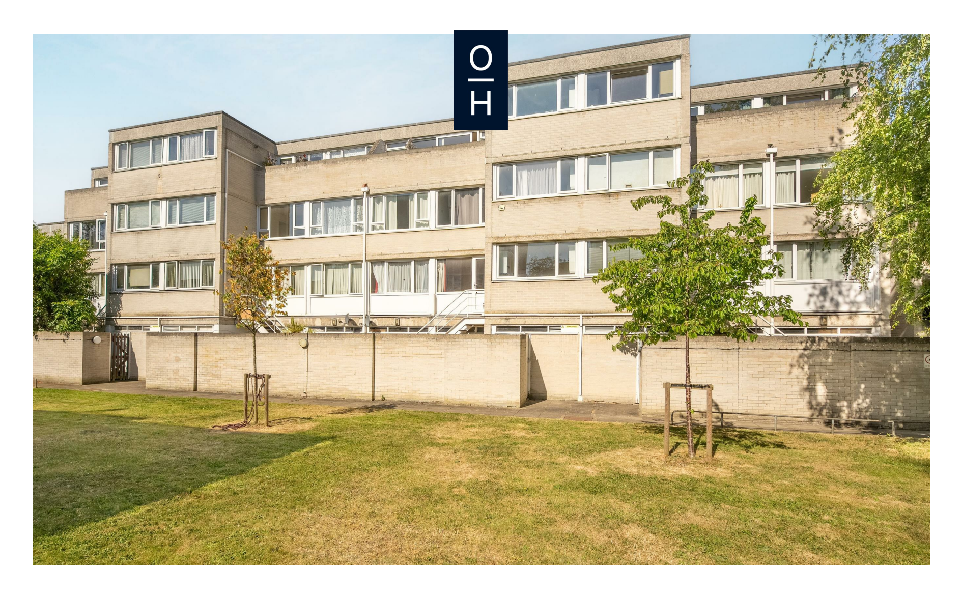
Christian Square, Windsor