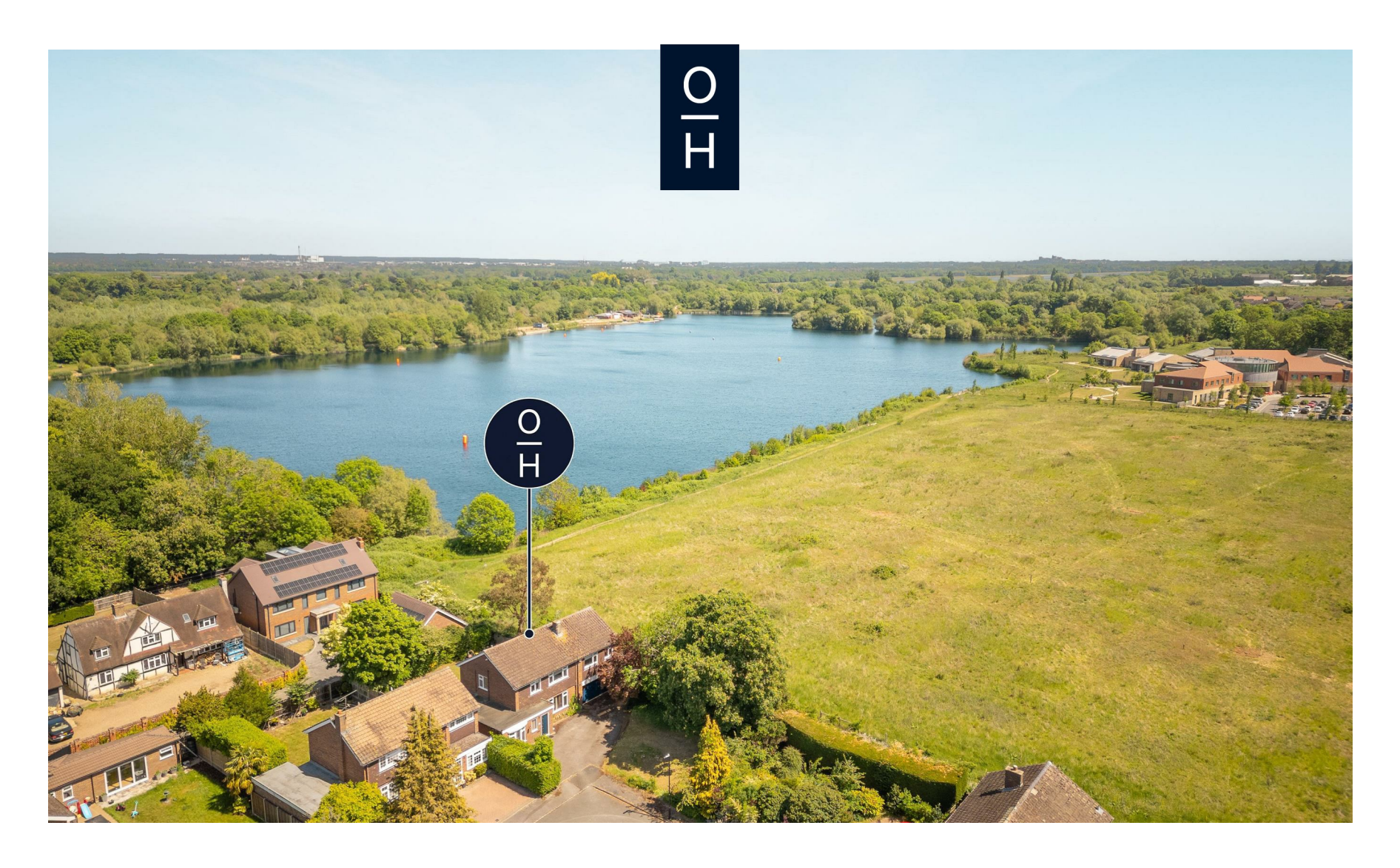
Court Close, Maidenhead