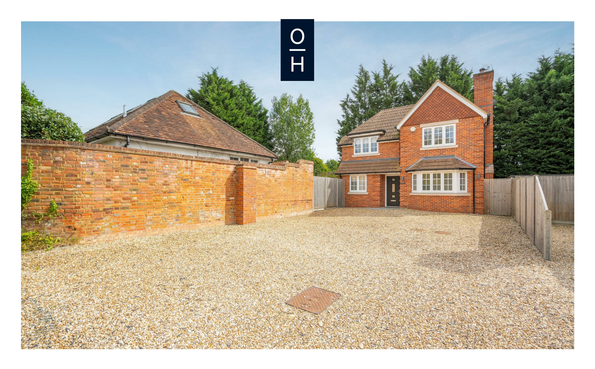
North Street, Winkfield