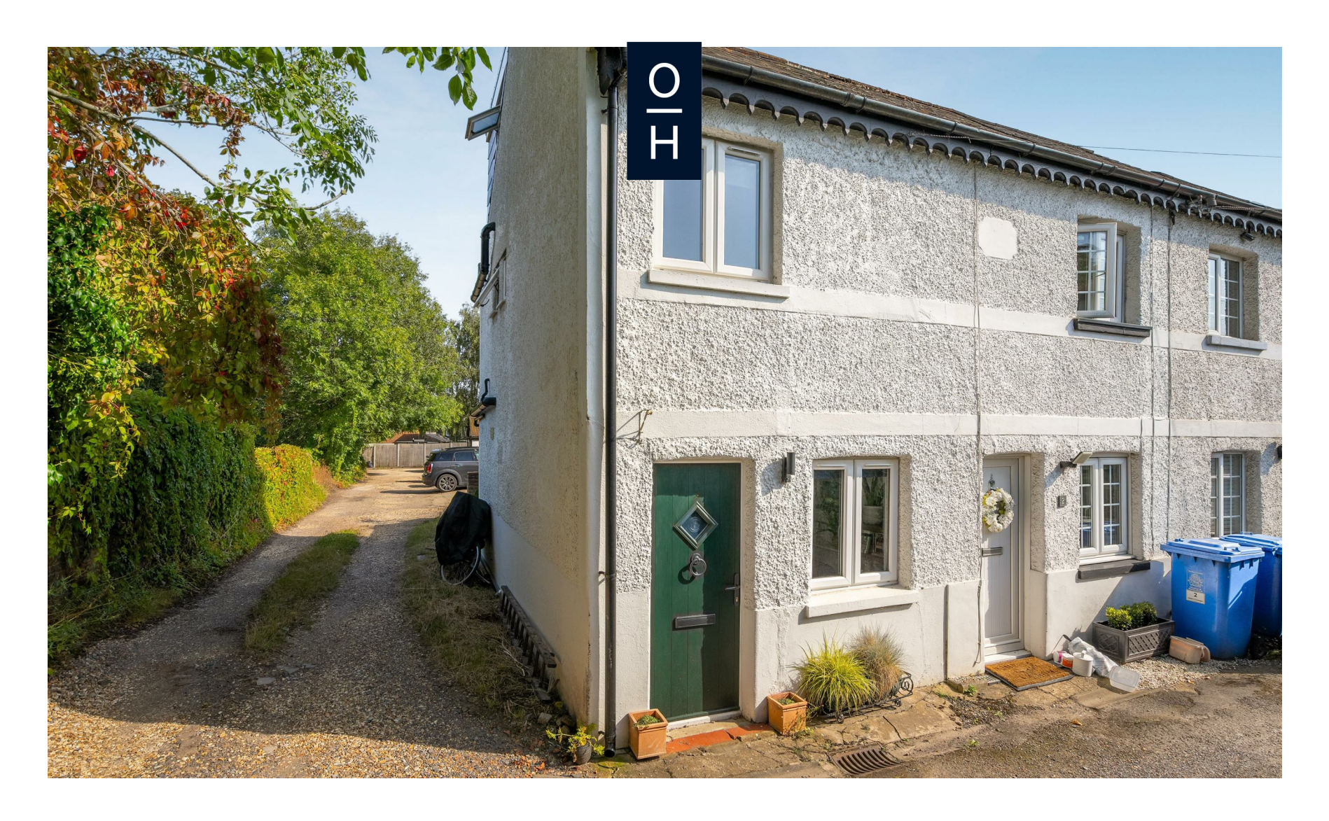
Albert Cottages, Windsor