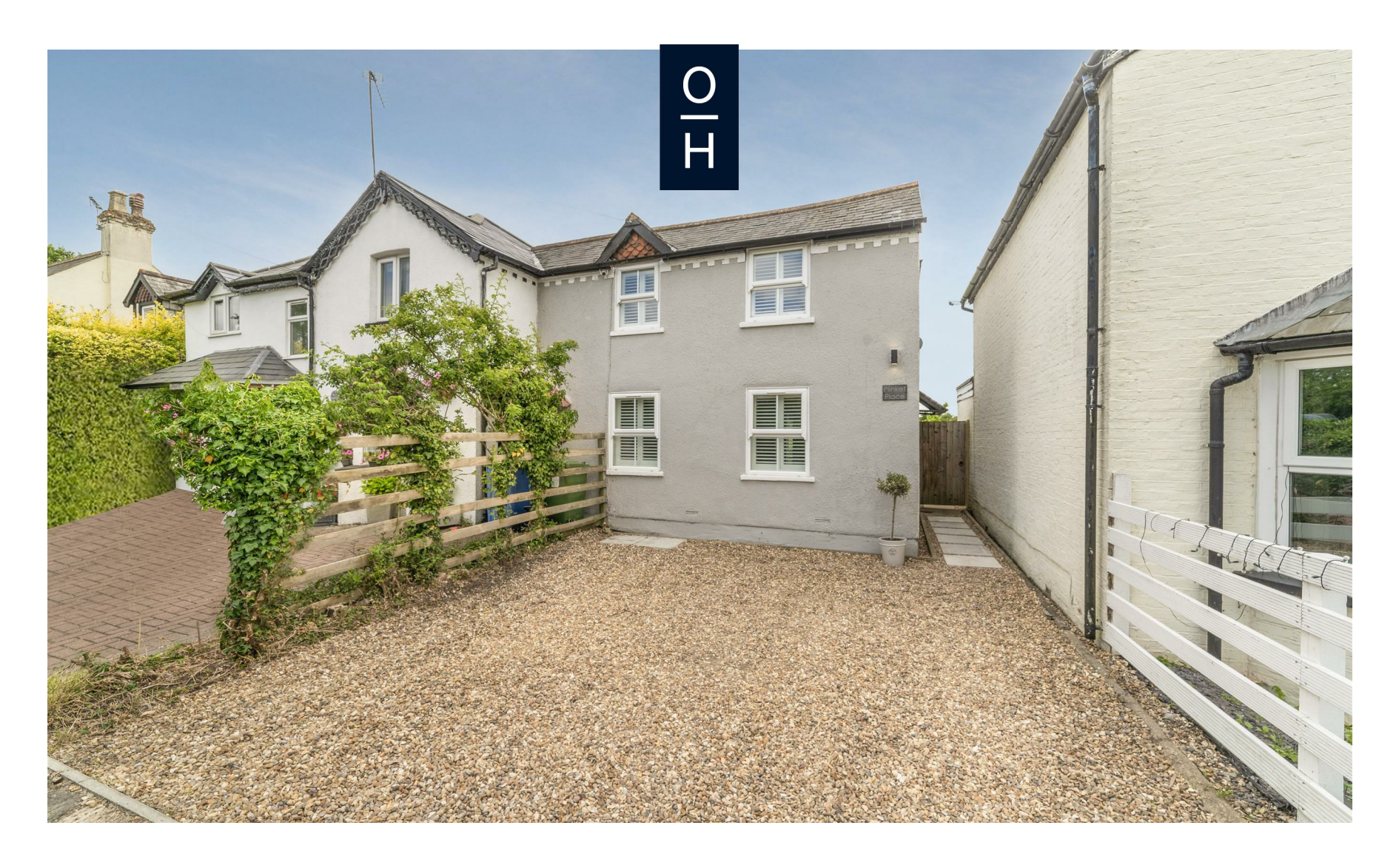
North Street, Winkfield