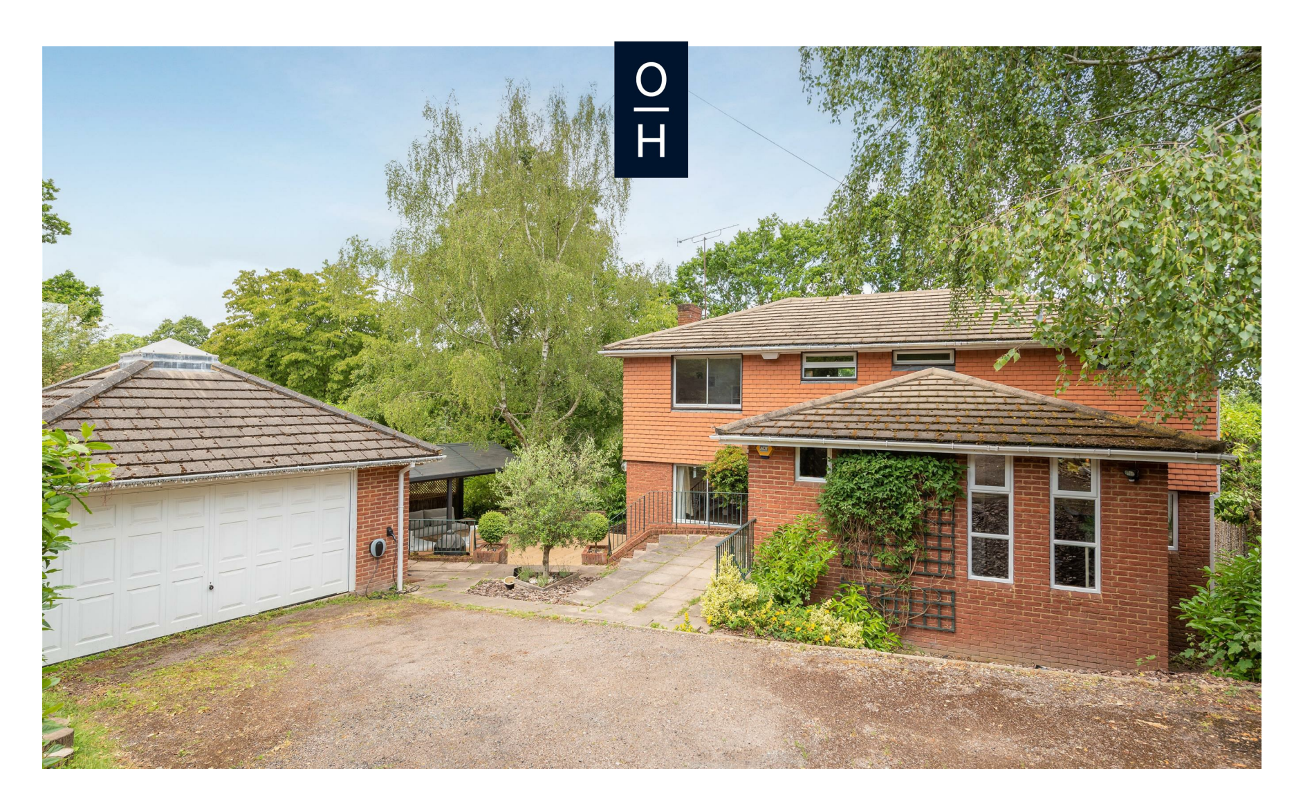
St. Leonards Hill, Windsor